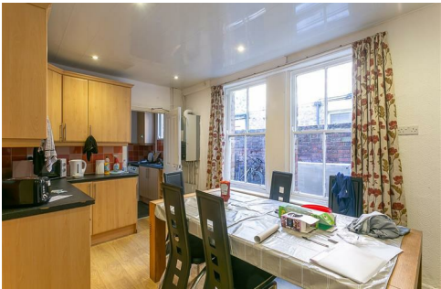
2ND FLOOR 259 sq ft. (24.1 sq.m.) approx.