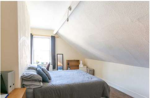
1ST FLOOR 793 sq ft. (73.7 sq.m.) approx.